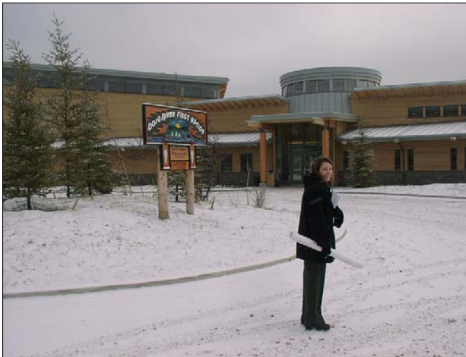
Meeting at the new Doig River First Nations Community Hall

The First Nations sessions identified a range of input on land-use, resource mgt., community services and economic development. An open informal dialogue format was used for these meetings and the results summarized according to an non-prioritized list of key topic headings.