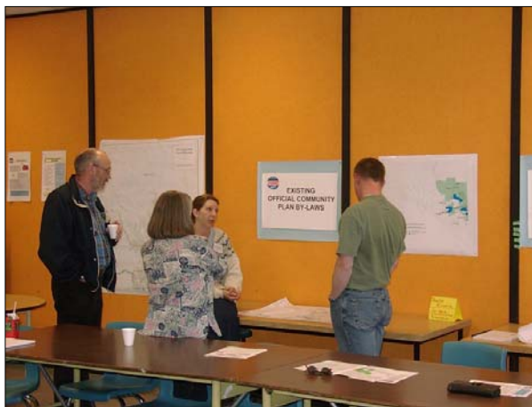
Reviewing Zoning Maps at the Clearview meeting