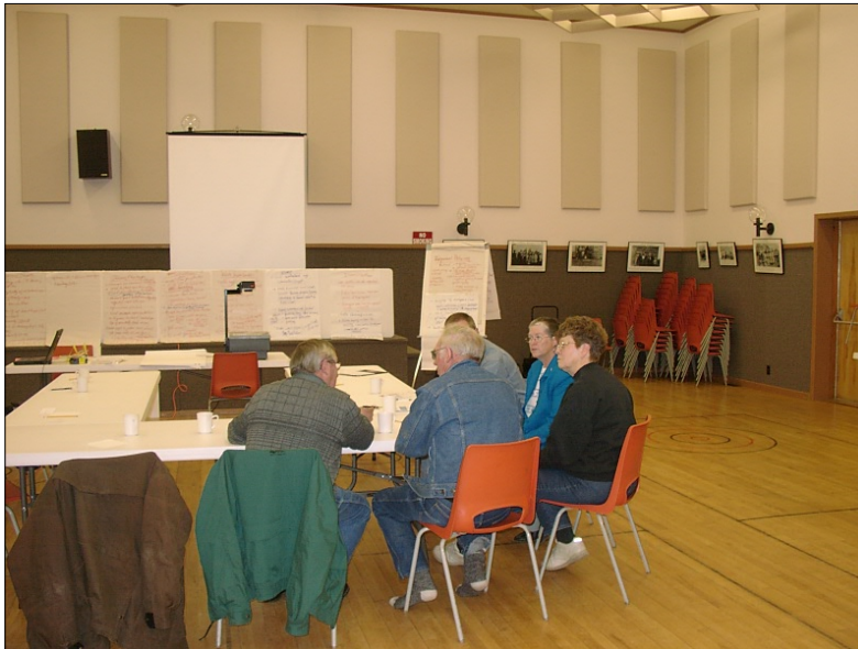
Break-out discussion at Rolla workshop

To date, a total of 31 individuals/organizations were identified by the PRRD and the consultant as having particular expertise about various sectors of interest in development of the Rural Plan. Of the 20 individuals assigned to the consultant, all interviews were completed with key informants. Sectors covered to date include transportation, tourism, environment, heritage, recreation, real estate, economic development, education, water management, and industry. Considerable insight was gained about the topics in terms of current trends, issues and opportunities affecting their sector of interest. Recommendations for policy development were also presented as part of the consultation.