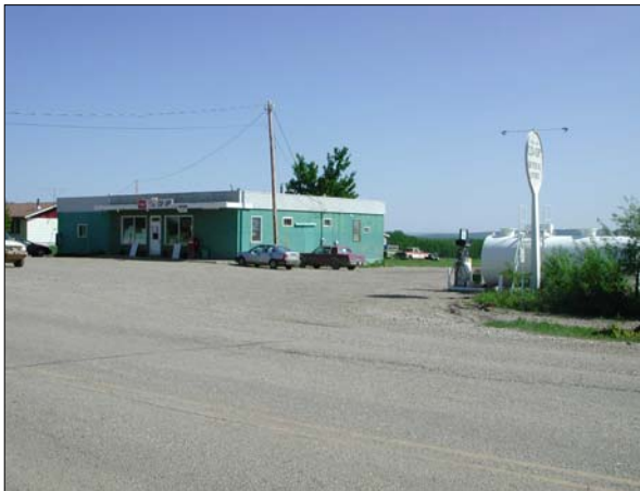
Cecil Lake General Store