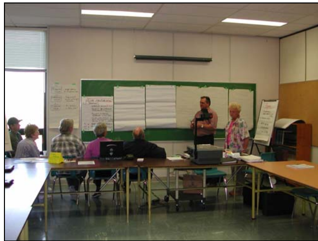
Listening to Clearview area residents