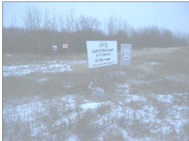
Milligan Rd. access to Ring Border oil & gas fields