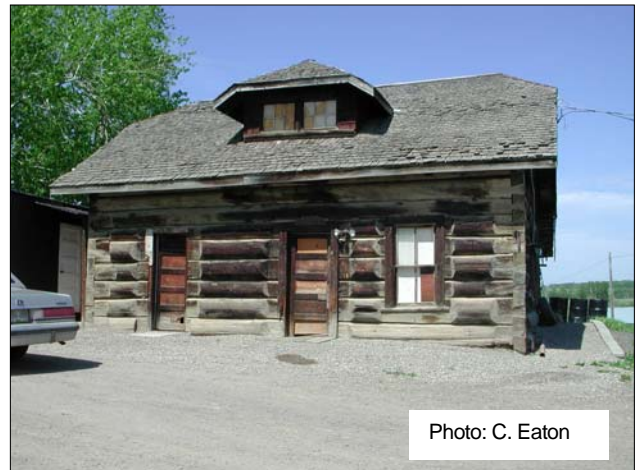
Young's Heritage Building (1929) at Rose Prairie