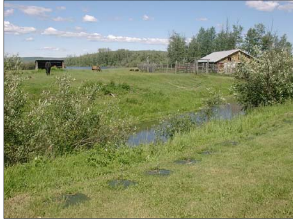
Promoting riparian protection at Ducks Unlimited property on Swan Lake