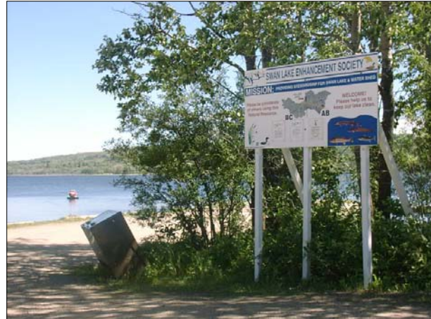
Signage for Swan Lake stewardship awareness

What are some of the challenges or issues currently facing your community? What are some suggested actions for dealing with them?