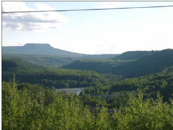
Scenic views of the Pine River