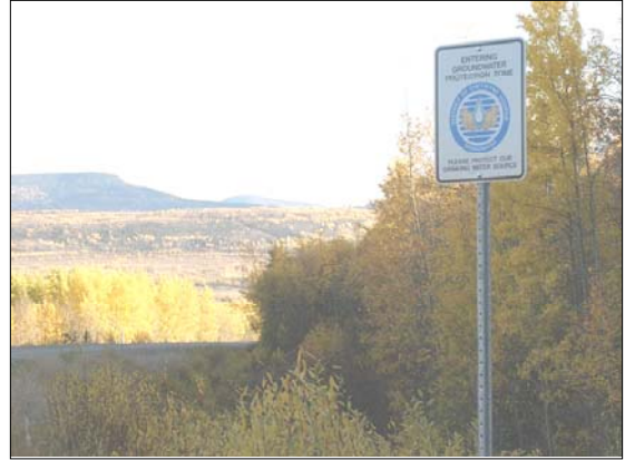
Aquifer awareness signage for Chetwynd's groundwater supply